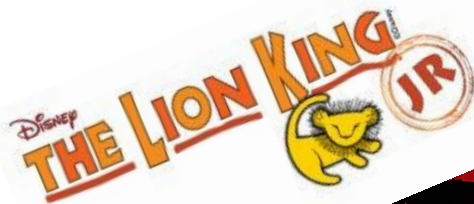
Middle school students presented The Lion King, Jr. on the last day before switching to virtual learning due to the pandemic, Friday, March 13, 2020.

Mission and Catholic Identity Academic Excellence Innovative Programs Educating the Whole Student