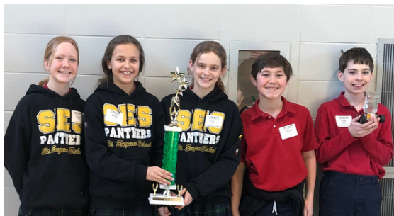
Our sixth grade team won first place overall at the Dominican Challenge.