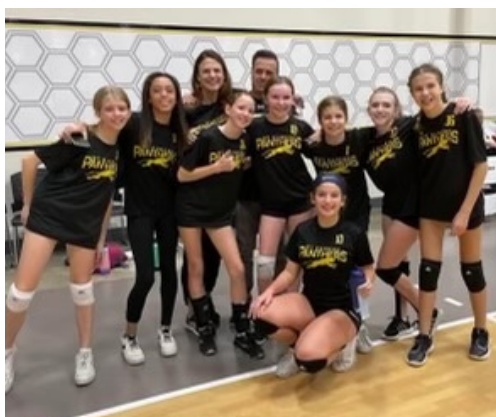
The seventh/eighth grade girls volleyball team made it to the Seton Volleyball Championship.