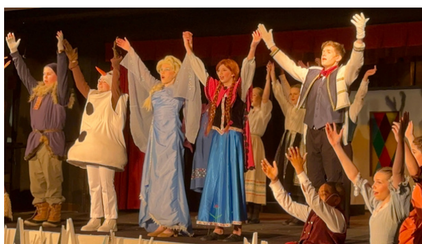
Middle school students had an amazing run performing Disney's Frozen Jr.