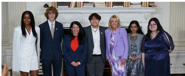
Students with first lady Jill Biden pose during an event in honor of the Class of 2022 National Student Poets Program on Sept. 27, 2022.